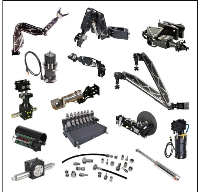
Example of Hydro-Lek tooling skids (left) and range of tooling components (right)

For further information about all the above applications, please call 01489 898000 or contact rovs@seaeye.com .